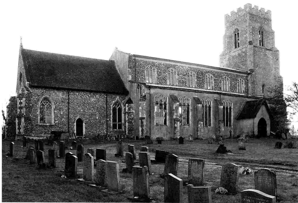
FIG. 133 – The exterior of Combs church from the north-east.